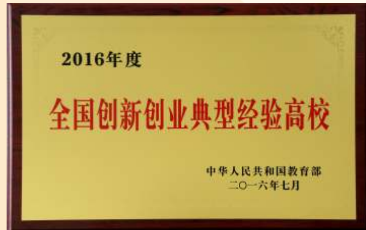
2016 National Top 50 Universities and Colleges of Outstanding Experiences in Creativity and Entrepreneurship Education awarded by China's Education Ministry

The only educational institution in Shaanxi Province to receive the 2015-2017 most highly graded “China Social Organization of Grade 5A” awarded by the provincial Bureau of Civil Affairs ( see picture on the right ) as well as “National Excellent Social Organization” awarded by China's Civil Affairs Ministry.