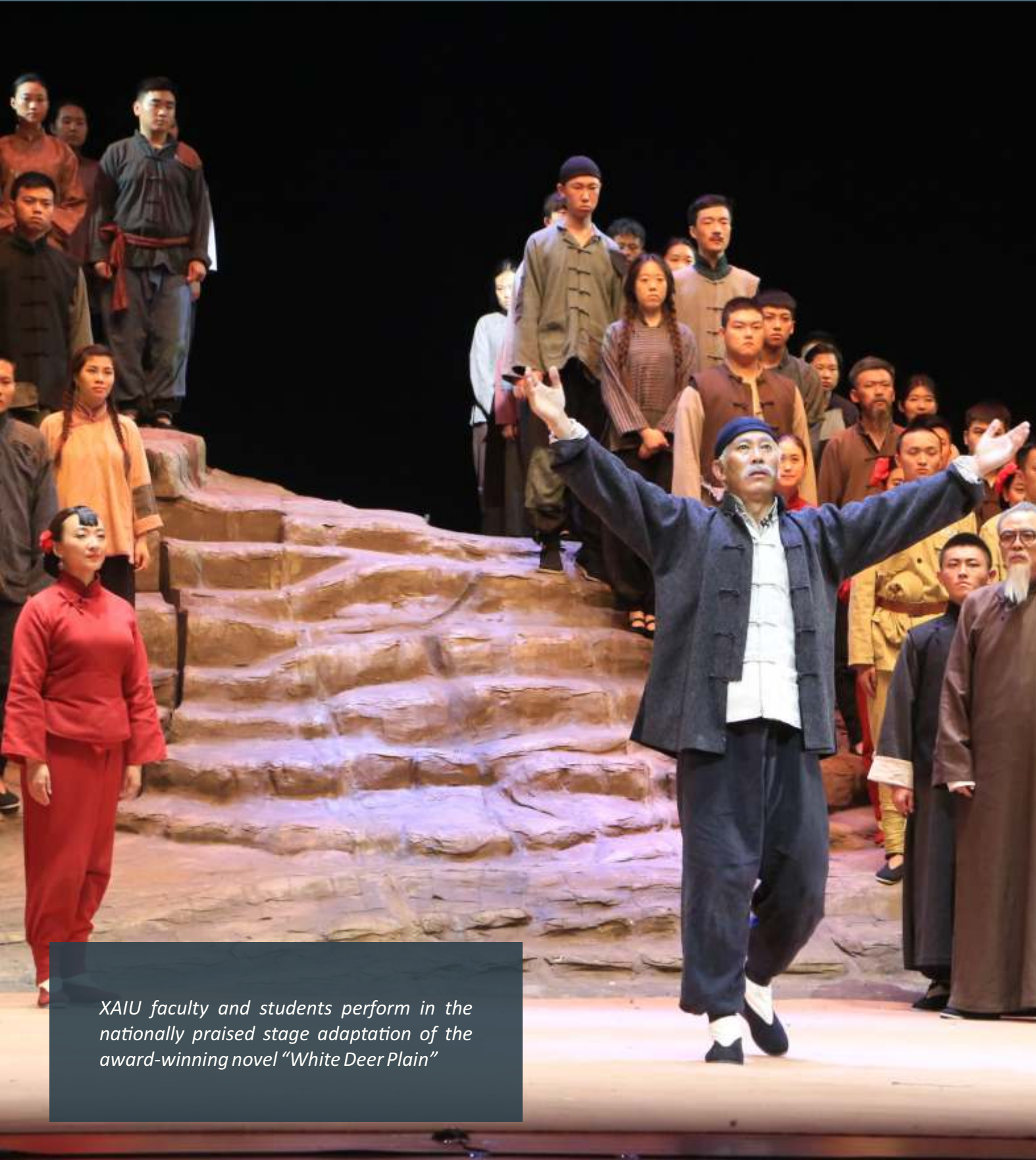
XAIU faculty and students perform in the nationally praised stage adaptation of the award-winning novel "White Deer Plain"